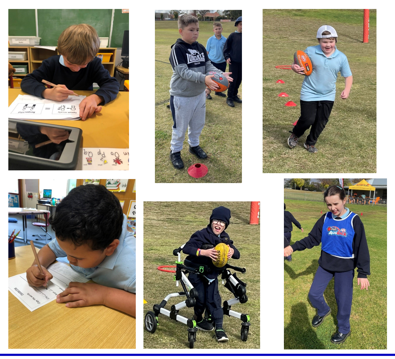
Quality Education ~ Towards Independence

We were lucky enough to have a day at the AFL Fun Day at George Park. The weather cleared for us and we were all exhausted by the fun activities we did. This included obstacle courses, running, kicking, ball handling and tackling.