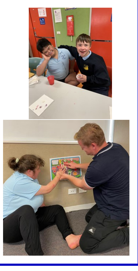
Quality Education ~ Towards Independence